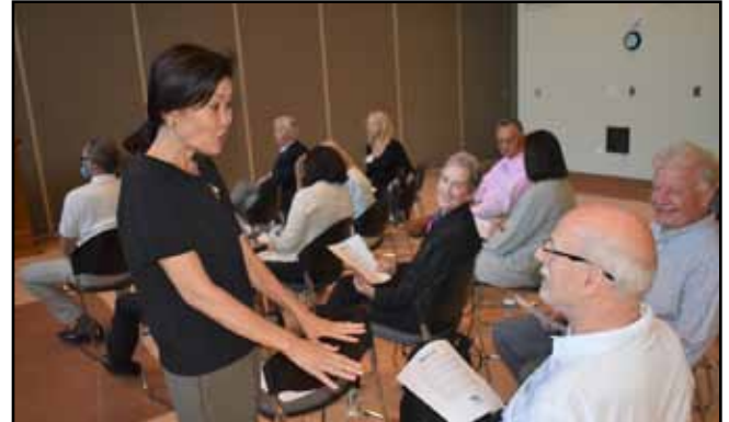
Congresswoman Steel chats with constituents before event