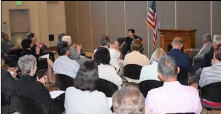
The Fireside Chat was enjoyed by an interested audience

More than eighty years ago, President Franklin Delano Roosevelt drew a fractured and weary nation together with a series of Fireside Chats from the White House. In this current time of controversy and division, the Chamber thought the time was right for our new Congresswoman, the Honorable Michelle Steel, to spend an evening in an intimate environment with Chamber members.