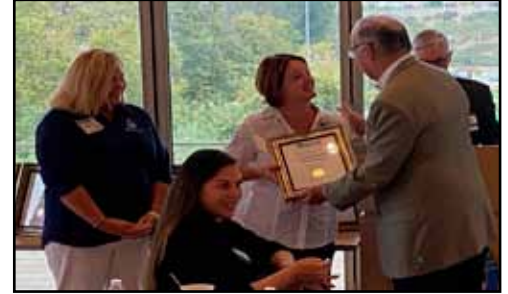
New and renewing members were recognized