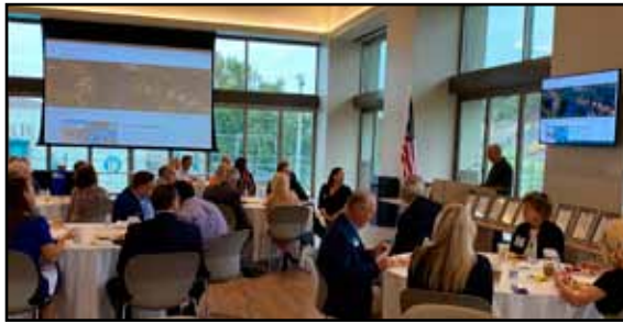
A good and tasty time was had by all!