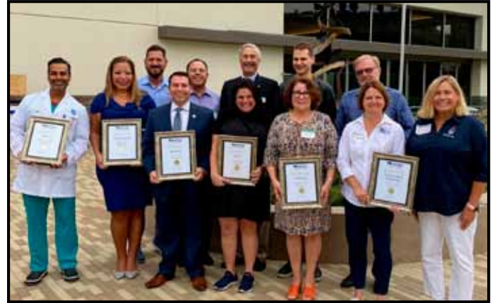
Renewing members were also recognized